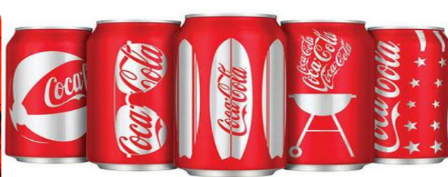
Sir. Muhtar Kent